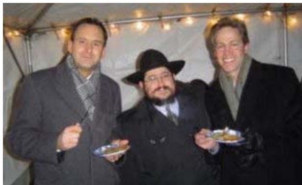
Governor of Minnesota, Tim Pawlenty

... and Minnesota Senator Norm Coleman (far right) celebrate.